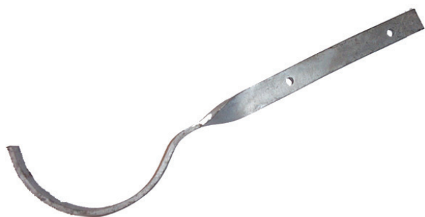
FRR617 Side Rafter Bracket