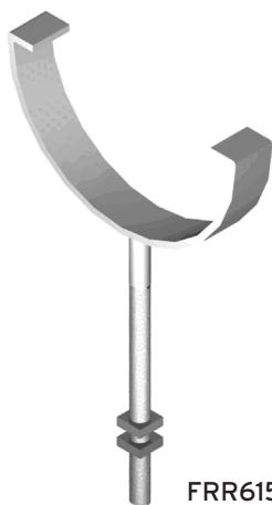
FRR615 Rise and Fall Bracket