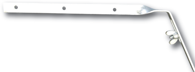
FRR614 Adjustable Side Rafter Bracket

Manufactured from galvanized steel offering a strong durable fixing resistant to corrosion. All products available for Round rainwater system.